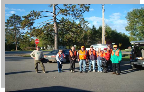
Roadside Clean-up Volunteers