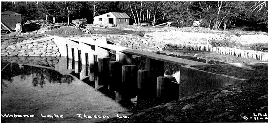
June 11, 1940, upstream view.