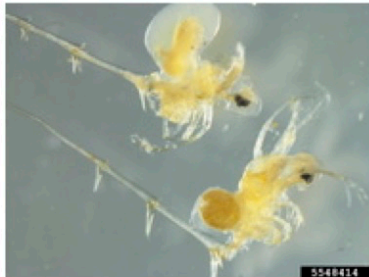
Spiny Waterflea