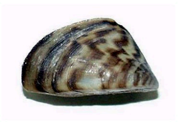
Zebra Mussels

Looks similar to: Native Predatory zooplankton