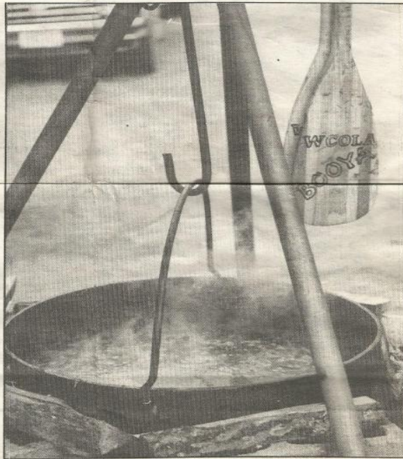
THE POT OF BOOYA OR STEW simmered for more than 12 hours before it was ready to be served at the WCOLA picnic.

The Wabana Chain of Lakes Association began meeting and organizing the summer of 1988. It is an active organization, having accomplished a number of objectives, always keeping in mind its basic purpose — to maintain and improve the quality of the area's total environment. The next meeting will be held Saturday, Sept. 18, at 9:30 a.m. at the Wabana Town Hall.