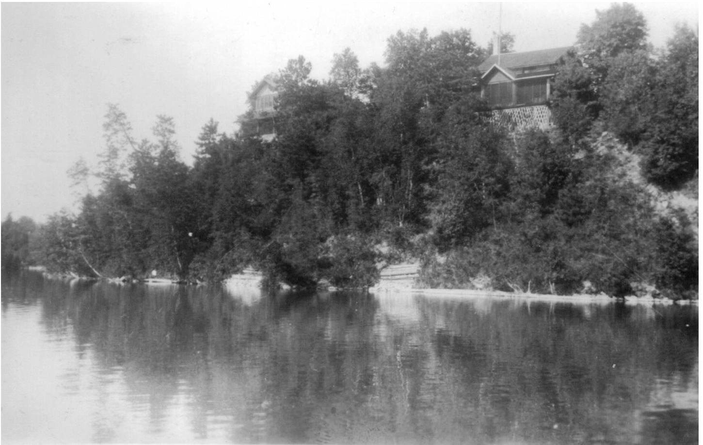
(Cliff House – featured in the last WCOLA Newsletter)