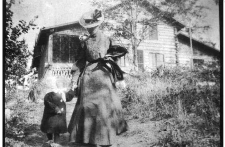
(Another photo of Cliff House – featured in Part 1 in the last WCOLA Newsletter – Unsure who the woman and child are.)