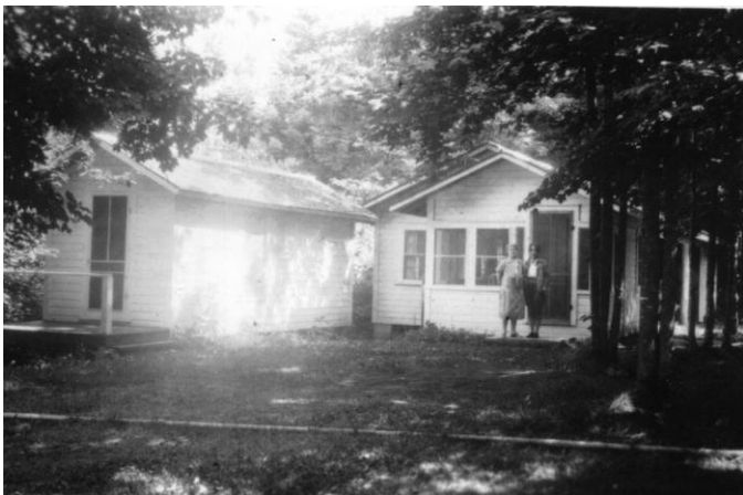
(Hillhouse on the Right – cottage on left was torn down prior to the early 1940's – Unsure who the women are.)